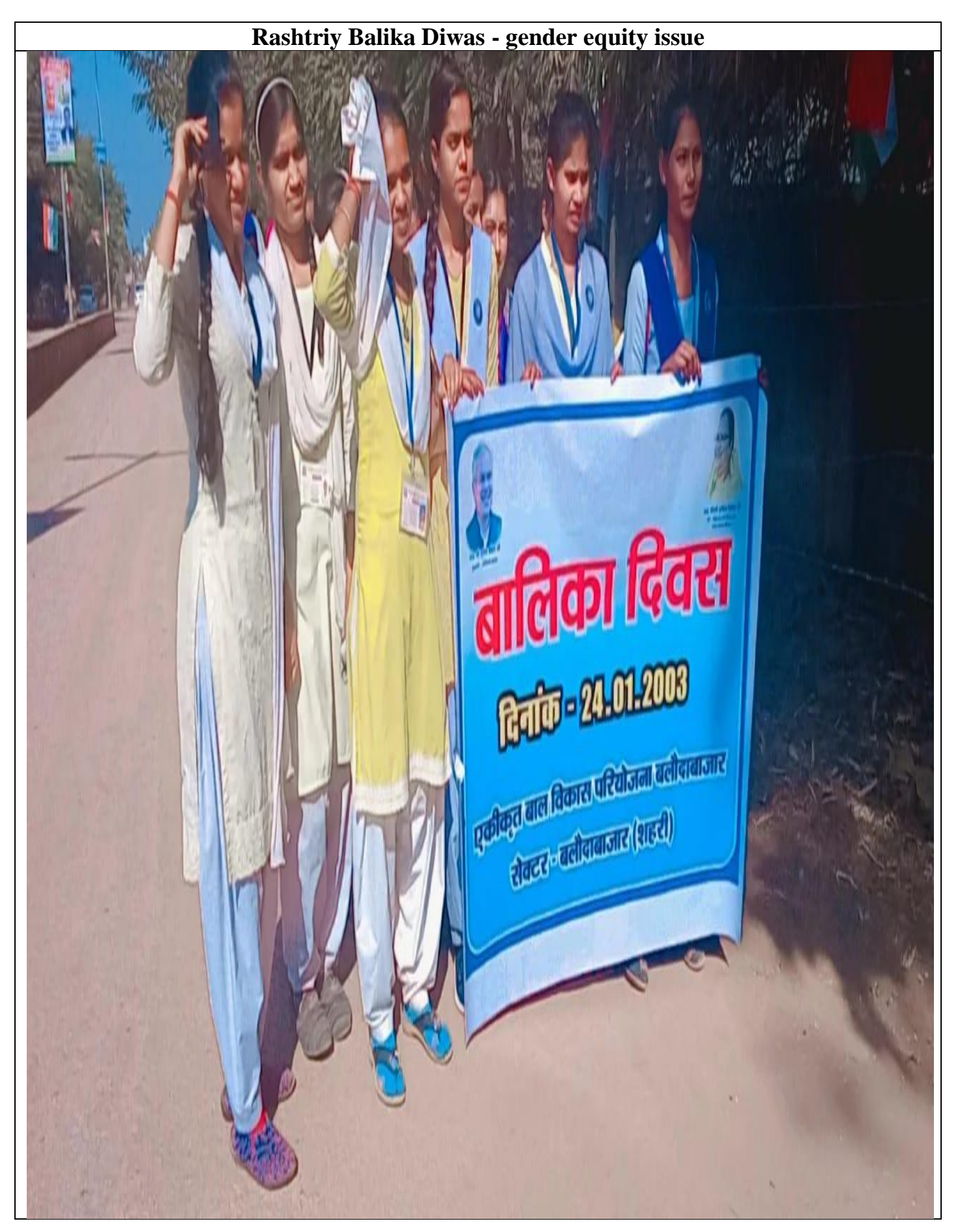
7.1.1 Measures initiated by the Institution for the promotion of gender equity during the years.